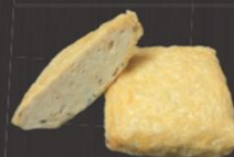
YASAI TOFU F1-58-029

RAW MATERIAL : SOYBEAN, TOFU SKIN, FISH, MODIFIED TAPIOCA STARCH, VEGETABLE OIL, DIMENSION : 40 MM.Ø WEIGHT : 110 G/PACK PACKAGE : 3 PIECES/PACK