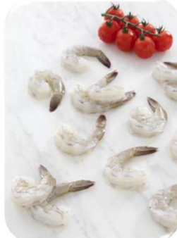
RAW PEELED DEVEINED TAIL-ON (BACK-CUT or Pin-PULL Deveined)

Package : full printed tray/ inner box or bulk