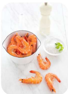
COOKED HEAD-ON SHELL-ON (ALIVE GRADE)

Package : full printed bag/ Plain bag with rider