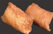
INARI F "WITH SEASONING SAUCE" F1-50-049

RAW MATERIAL : TOFU SKIN, VEGETABLE OIL DIMENSION : 15 MM.Ø x 35 MM.Ø WEIGHT : 790 G/PACK PACKAGE : 60 PIECES/PACK