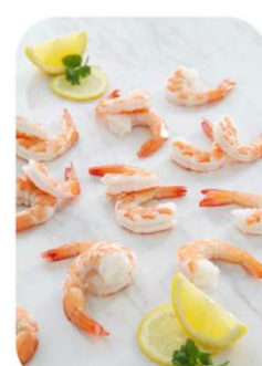
COOKED PEELED DEVEINED TAIL-ON (BACK-CUT or Pin-PULL Deveined)

Package : full printed bag/ Plain bag with rider or sticker