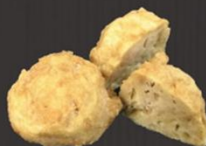
YUBA TEN G F1-58-021

RAW MATERIAL : TOFU, CARROT, MODIFIED TAPIOCA STARCH, SESAME, VEGETABLE OIL DIMENSION : 30 MM.Ø WEIGHT : 400 G/PACK PACKAGE : 50 PIECES/PACK