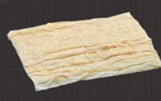
HIRA YUBA ⑤ F2-50-011

RAW MATERIAL : SOYBEAN DIMENSION : MADE TO ORDER WEIGHT : - PACKAGE : -