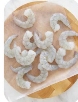
RAW PEELED DEVEINED TAIL-OFF (BACK-CUT or Pin-PULL Deveined)

Package : full printed bag/ plain bag with rider