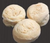
TEMARI YUBA S ⑤ F2-50-028

RAW MATERIAL : SOYBEAN DIMENSION : 10 MM.Ø x 60 MM.Ø WEIGHT : 400 G/PACK PACKAGE : 100 PIECES/PACK