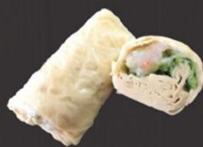
BROCCOLI YUBA MAKI F1-54-019

RAW MATERIAL : SOYBEAN DIMENSION : 10 MM.Ø x 20 MM.Ø WEIGHT : 300 G/PACK PACKAGE : 50 PIECES/PACK