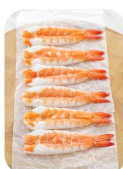
COOKED BELLY-CUT SHRIMP TAIL-ON WITH HEAD MEAT (SUSHI SHRIMP from ALIVE GRADE)

Package : plain tray with label/ inner box