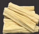
TM YUBA S ⑤ F2-50-034

RAW MATERIAL : TOFU SKIN, GINGKO NUT DIMENSION : 30 MM.Ø x 40 MM.Ø WEIGHT : 340 G/PACK PACKAGE : 20 PIECES/PACK