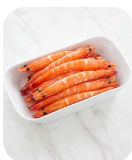
COOKED HEAD-ON CENTER PEELED (ALIVE GRADE)

Package : full printed tray/ inner box or bulk