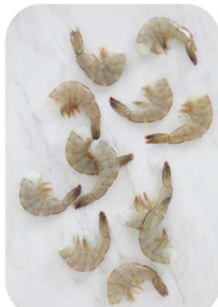
RAW HEAD-ON SHELL-ON (Headless or Easy-peel)

Package : full printed tray/ inner box or bulk