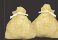
MOCHI KINCHAKU ⑤ F1-65-001

RAW MATERIAL : FRIED TOFU, GLUCOSE VEGETABLE OIL DIMENSION : 60 MM.Ø x 60 MM.Ø WEIGHT : 850 G/PACK PACKAGE : 30 PIECES/PACK