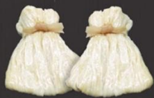
NABE YUBA ⑤ F1-51-039

RAW MATERIAL : SOYBEAN DIMENSION : 100 MM.Ø x 40 MM.Ø WEIGHT : 660 G/PACK PACKAGE : 12 PIECES/PACK