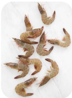
RAW HEAD-ON SHELL-ON (ALIVE GRADE)

Size : 16/20, 21/25, 26/30 to 71/90 per KG